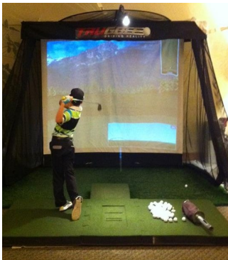
TruGolf Simulator www.trugolf.com

The weather will always be perfect and we can have your favorite football game on for an overall great experience. For more information on the simulator feel free to go to www.trugolf.com and select Technique Pro. The member usage fee will be $10 per player for a round of golf and range time and $20 for an accompanied guest to play a round of golf and range time. A ten punch pass can be purchased for $90. Please call the golf shop with any questions.