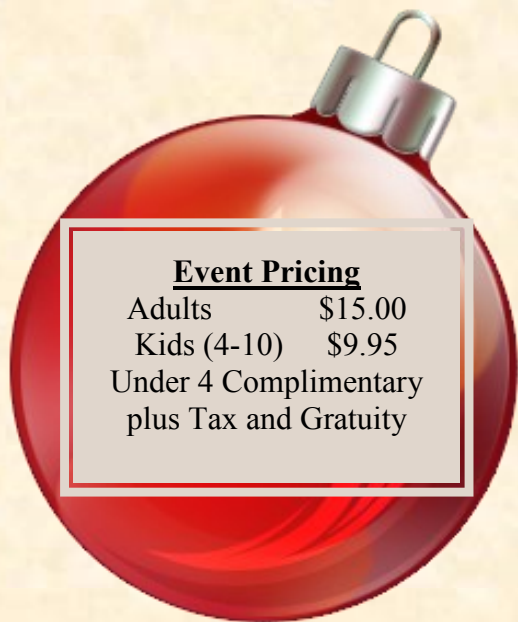
Photo with Santa & Breakfast Buffet Begins at 9am Santa will depart for the North Pole at 11:00 am