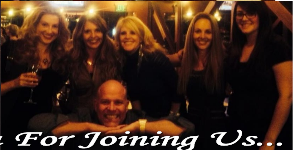
Thank You For Joining Us...