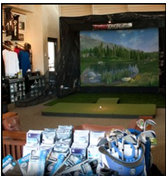
TruGolf Simulator www.trugolf.com

Tee Times can be made one week in advance with the Golf Shop. 435-649-2700 801-531-9000 ext. 3