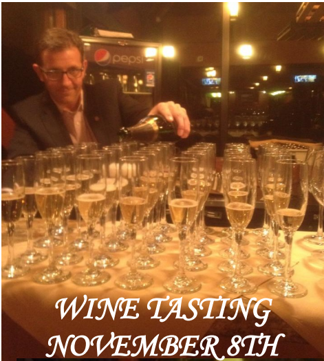
WINE TASTING NOVEMBER 8TH